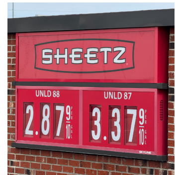
50¢ Ohio Mar. 14, 2026