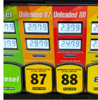
40¢ Nebraska Dec. 9, 2025