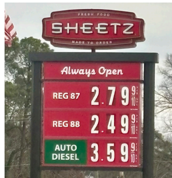
30¢ Virginia Dec. 27, 2025