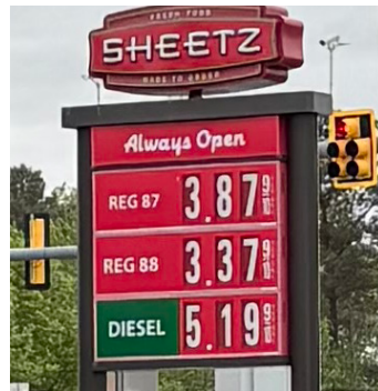
50¢ Virginia Apr. 19, 2026