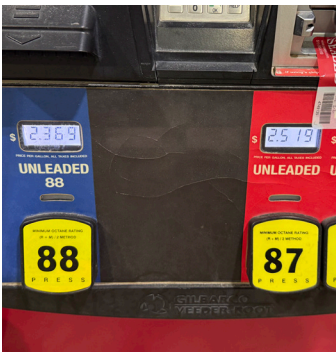
15¢ Kansas Feb. 4, 2026