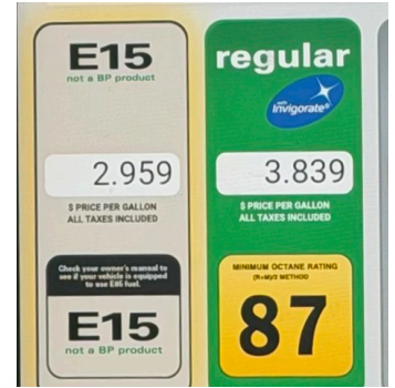
88¢ Wisconsin Apr. 12, 2026