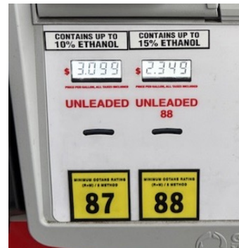
75¢ Iowa Mar. 3, 2026