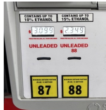
75¢ Iowa Mar. 3, 2026