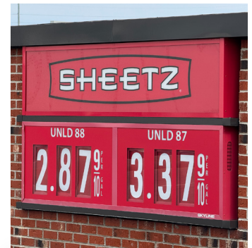
50¢ Ohio Mar. 14, 2026