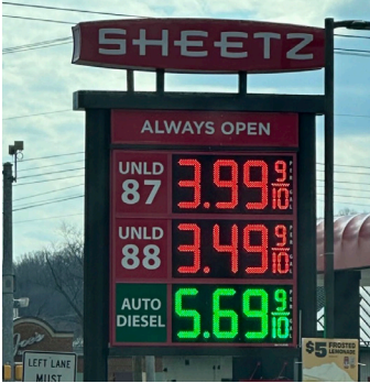
50¢ Penn. Mar. 19, 2026

More Savings at the Pump, Growth for America's Economy