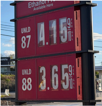
50¢ Penn. Apr. 20, 2026

More Savings at the Pump, Growth for America's Economy