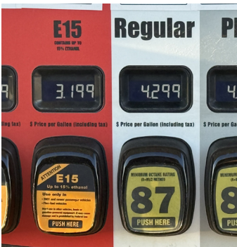
$1.10 Illinois Apr. 6, 2026