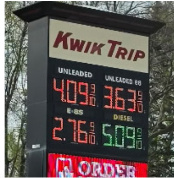
46¢ Minnesota Apr. 29, 2026