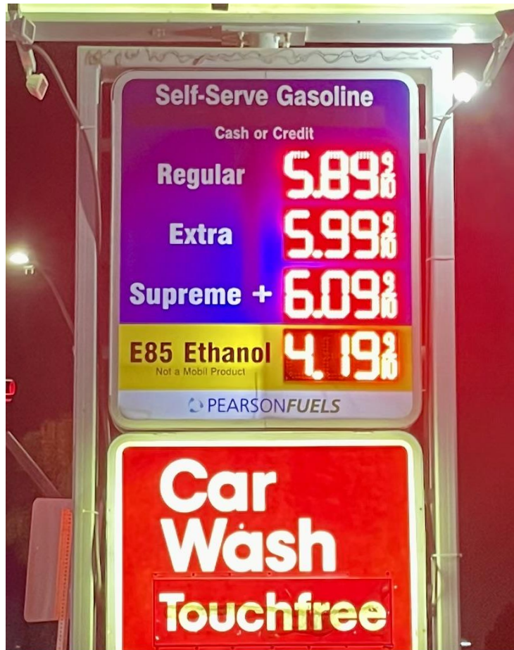
Mobil Station, San Diego, CA 4/6/2022

Additionally, with California’s significant growth of E85 used in flex-fuel vehicles (more than 62 million gallons sold at more than 300 locations in 2021 alone), the use of E85 will promote even greater reductions in GHG emissions, reductions of air toxics, and even greater consumer cost savings with some locations selling at a $2 per gallon discount to regular gasoline. We would continue to encourage CARB to push for policies that continue to strongly encourage, incentivize, and require the production and use of flex-fuel vehicles in conjunction with the use of higher bioethanol blends like E85, as well as continued investment in infrastructure for the expanded use of E85 in the state.